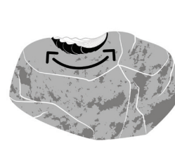
CONCAVE (CURVES INWARD)