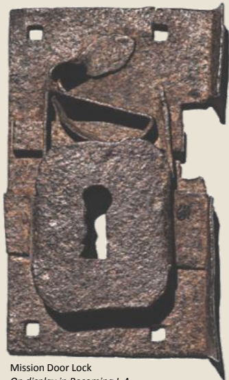
Mission Door Lock On display in Becoming L.A.