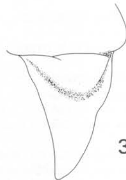
FIGURES 1-3. Formica longipilosa male (50X). 1, head, frontal view, without pilosity; 2, petiole, lateral view; 3, paramere, lateral view.